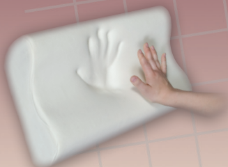
Core Memory™ Pillow, #197: viscoelastic memory foam