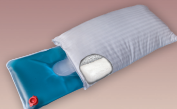
Core Deluxe Water Pillow, #294: fiber, water, built-in lobe Patent Pending