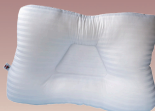
Tri-Core Pillow®, #200: high-resiliency fiber UK Patent #2-000-739