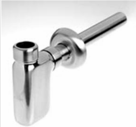
Decorative Bottle Trap