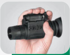
NVM14 Compact Monocular