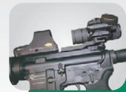
NVM14 with EOTech®