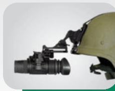
NVM14 with PAGST Helmet Mount