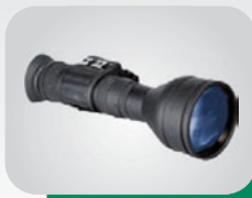
NVM14 with 3x Lens