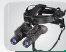
NVM14 with Dual Bridge