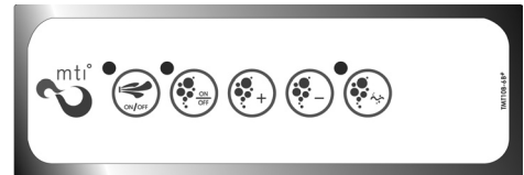
Example: Chrome keypad