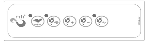
Example: White keypad

†Oil Rubbed Bronze finishes vary from manufacturer to manufacturer. MTI has selected a finish that is compatible with many available. If an exact match is desired, submit a sample and MTI will match it. Special Finishes upcharge will apply. Not available for air baths.