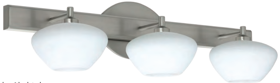
3SW-541007-SN Opal Matte

UL or ETL Listed. Suitable for Damp Locations (interior use only).