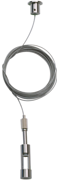
Shown approximately 30% actual size.