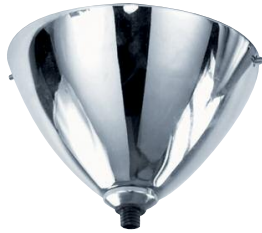
Shown approx. 30% actual size.