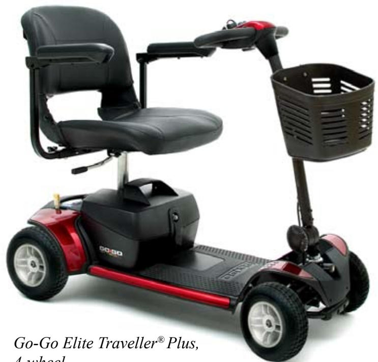
Go-Go Elite Traveller® Plus, 4-wheel

The Go-Go Elite Traveller® Plus was designed to bring travel scooters to a greater range of people than ever before. An increase in length and width, and a weight capacity of 300 lbs. (325 lbs. w/HD version) combine with wraparound delta tiller to allow both the larger individual and those with limited dexterity to experience the benefits of a travel specific mobility product for the first time. One hand Feather-touch disassembly makes the Go-Go Elite Traveller Plus the easiest travel scooter to take along anywhere.