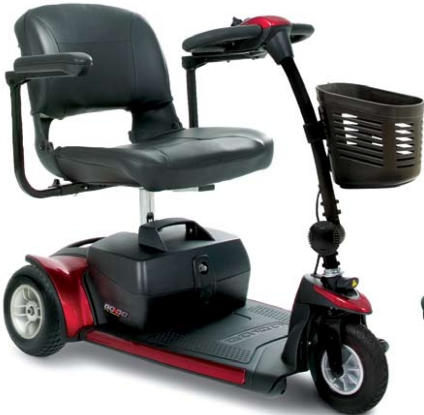
Go-Go Elite Traveller® Plus, 3-wheel

The Go-Go Elite Traveller® Plus was designed to bring travel scooters to a greater range of people than ever before. An increase in length and width, and a weight capacity of 300 lbs. (325 lbs. w/HD version) combine with wraparound delta tiller to allow both the larger individual and those with limited dexterity to experience the benefits of a travel specific mobility product for the first time. One hand Feather-touch disassembly makes the Go-Go Elite Traveller Plus the easiest travel scooter to take along anywhere.