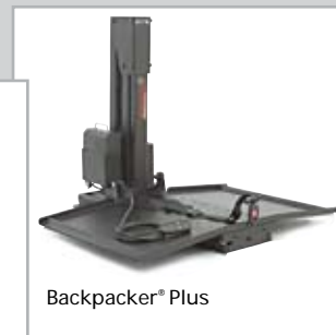
Backpacker ® Plus

(US) 800-800-8586 • (Canada) 888-570-1113 • www.pridemobility.com