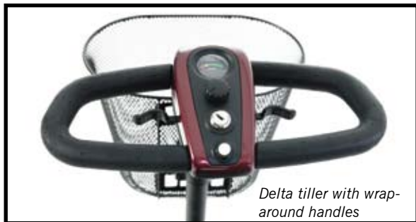
Delta tiller with wrap-around handles

3 sets of exciting colors with every scooter!